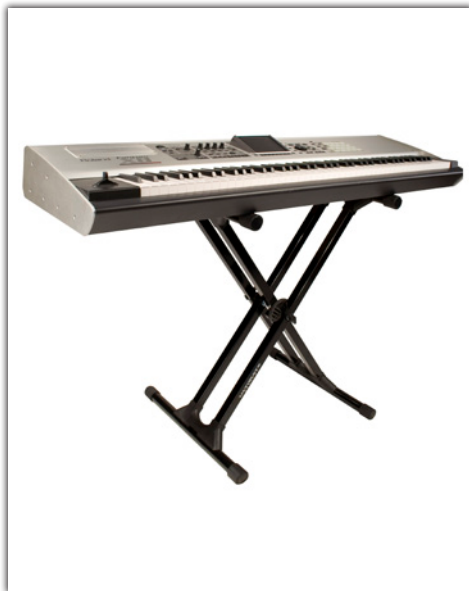
IQ-3000 Reinforced Double Brace X-Stand

ULTIMATE SUPPORT™ LIMITED LIFETIME WARRANTY