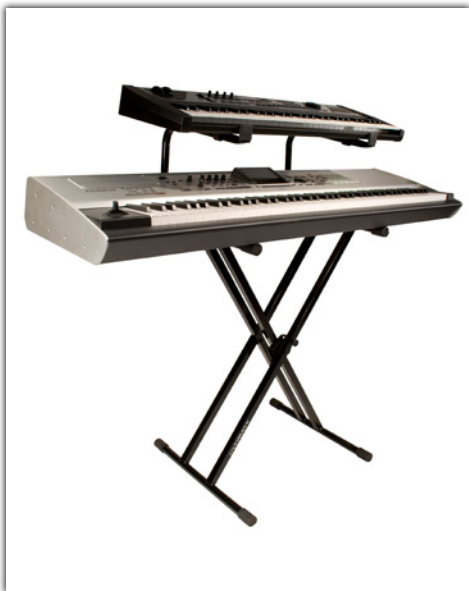
IQ-2200 Signal Brace X-Stand with Second Tier