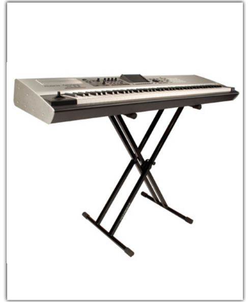
IQ-2000 Double Brace X-Stand