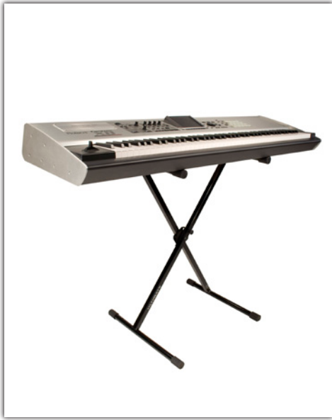
IQ-1000 Signal Brace X-Stand

The IQ Series redefines the X-style keyboard stand, bringing a new level of stability and innovation to the lightweight, gigging-minded design. Offering a range of height settings for sitting-to-standing playing comfort, the IQ-1000, IQ-1200, IQ-2000, IQ-2200 and IQ-3000 all feature Ultimate Support's patented Memory Lock system and unique stabilizing end caps, giving keyboardists timesaving onstage luxuries along with peace of mind. IQ Series stands hold true to Ultimate Support's twofold commitment – providing uncompromising instrument stability while remaining at the forefront of musician-centric, innovative design – and are ideal for supporting everything from lightweight synthesizers and MIDI controllers to the heaviest of professional keyboard workstations.