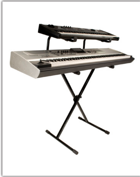
IQ-1200 Signal Brace X-Stand with Second Tier